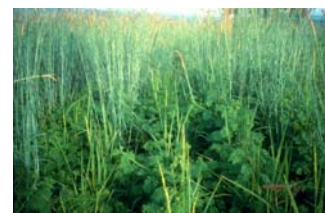
Weeds in rice, Vietnam