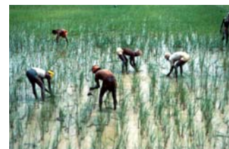
Hand weeding rice in India