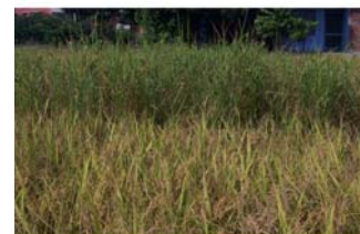
Rice in India - weedy at top, treated at bottom