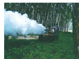
Fogging to control leaf fall