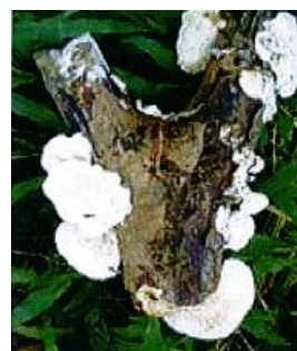
White root rot