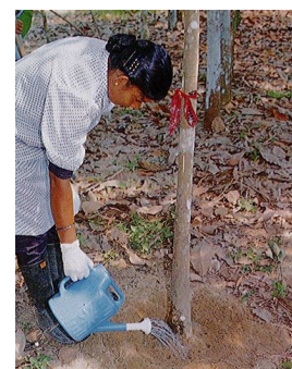
Drenching soil with fungicide to control white root rot